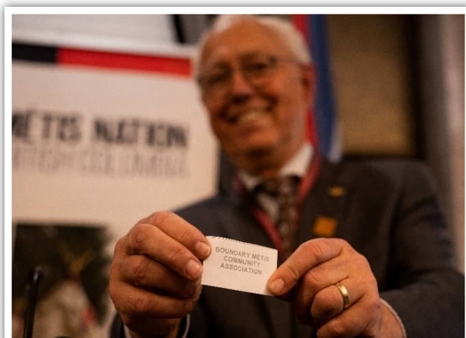
Murray Rankin, Minister of Indigenous Relations and Reconciliation, selects the winning raffle ticket at the Louis Riel Day reception for Members of the Legislative Assembly in Victoria.

The funds will facilitate policy engagement across all MNBC ministries and committees .