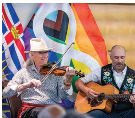
Métis musicians blessed participants with sounds of the fiddle during this MEY conference.