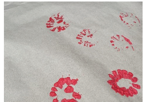
Poppy artwork using toilet paper rolls Awasisak Achakos Head Start, Kelowna, BC